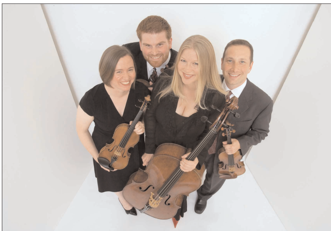
On Oct. 26, the Cypress String Quartet will start off Montalvo's popular Sunday afternoon Salon series with a performance of Beethoven Quartet Opus 130.

Just three days after Ryan’s appearance, Montalvo will kick off its popular Sunday afternoon Salon series with the Cypress String Quartet. This acclaimed ensemble’s repertoire ranges from familiar Baroque masterpieces to recent works by contemporary composers. Throughout the 2008-09 season, Cypress will continue its exploration of Beethoven’s quartets with the “Late Beethoven Continues”